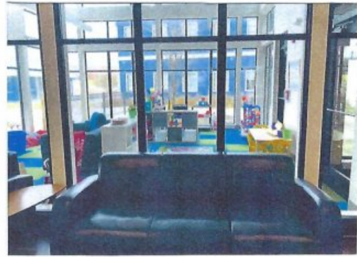
Seating area and View of Inside Playroom