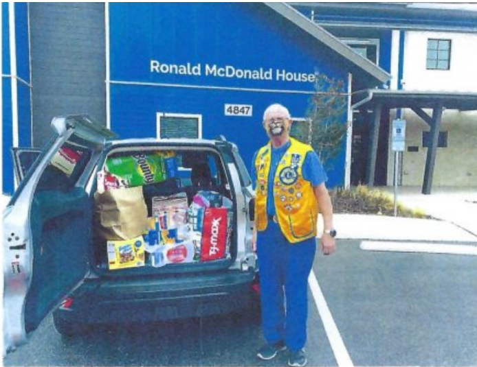
Stuff the Trunk Project for the Ronald McDonald House