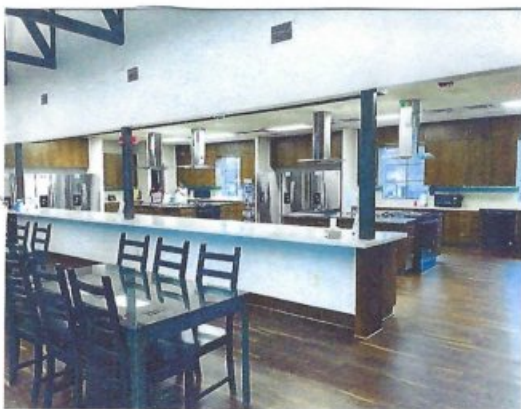
Kitchen and Dining Room