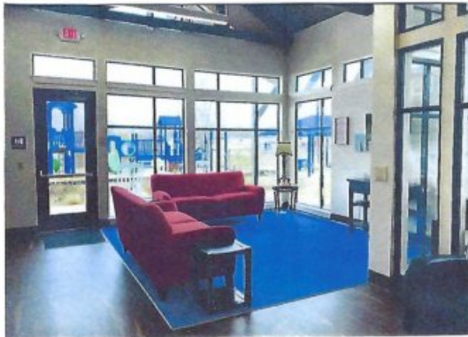
Seating Area and View of Outside Playground