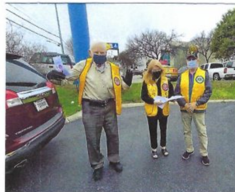
In a Parking Lot "Taking Care of Business." Club Secretary receiving a New Member Application!