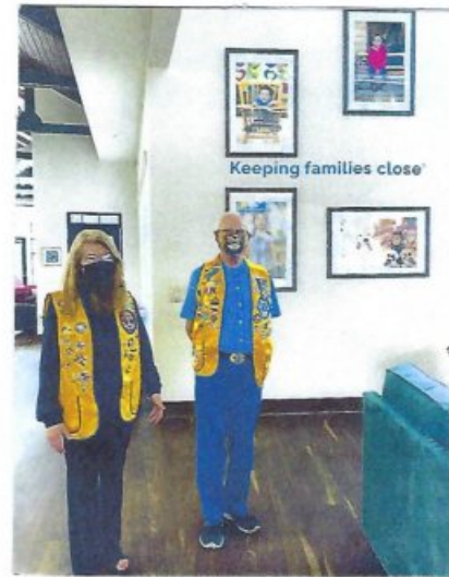
New Ronald McDonald House