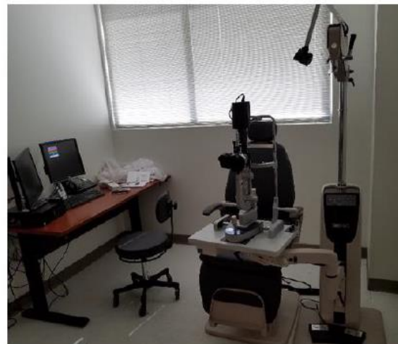
NEW EXAM ROOM AND EQUIPMENT