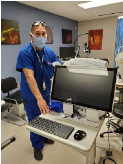
ZEISS OPTICAL COHERENCE ANGIOGRAPHY MACHINE