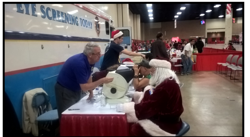
Squinting is first sign it may be time for further examination!!