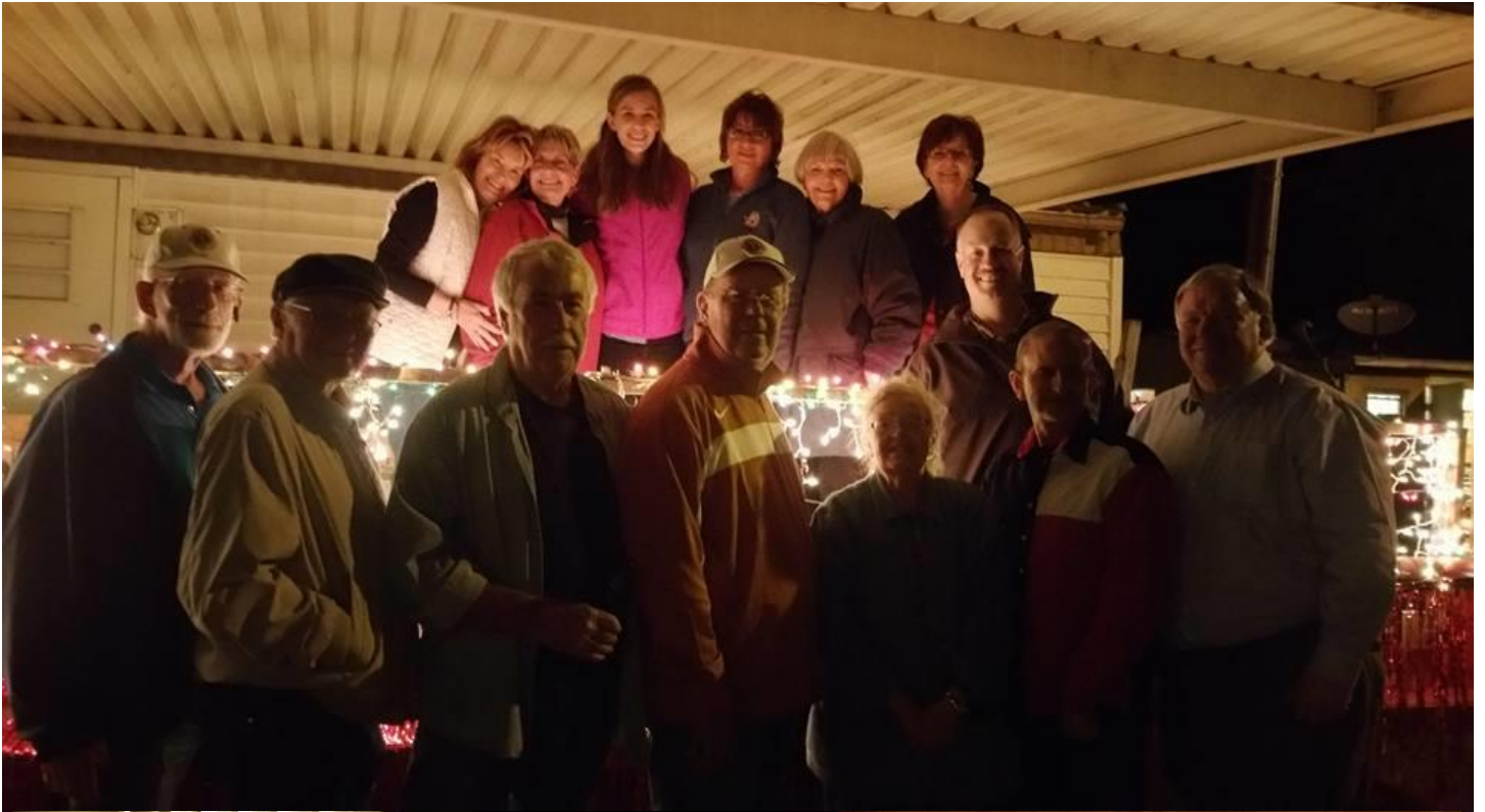
The Kerrville Host and Heart O' the Hills Lions clubs decorating float for the Kerrville Holiday Parade.