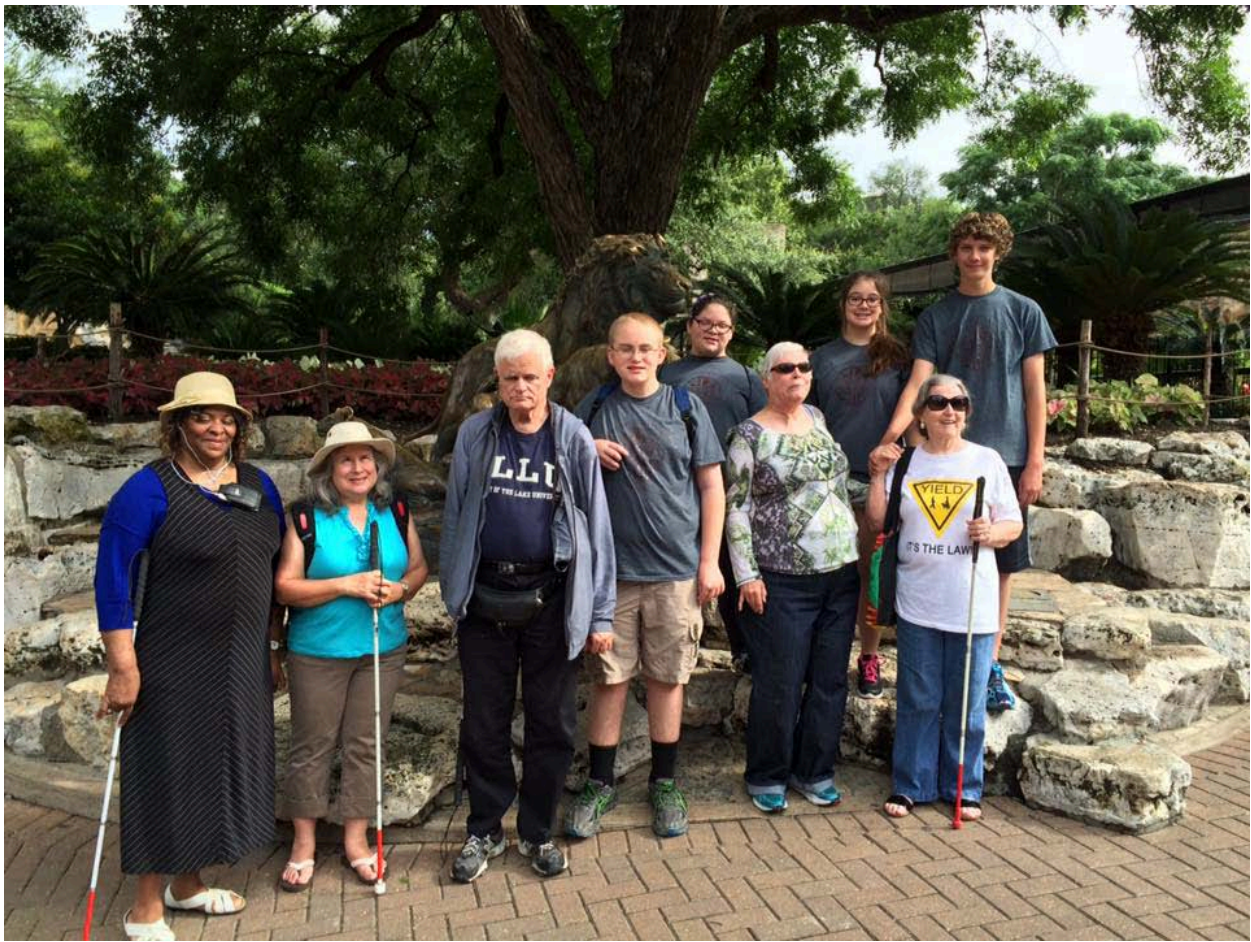
Stockdale Leos assisting as Sight Guides for the SA Association for the Blind on their zoo trip.