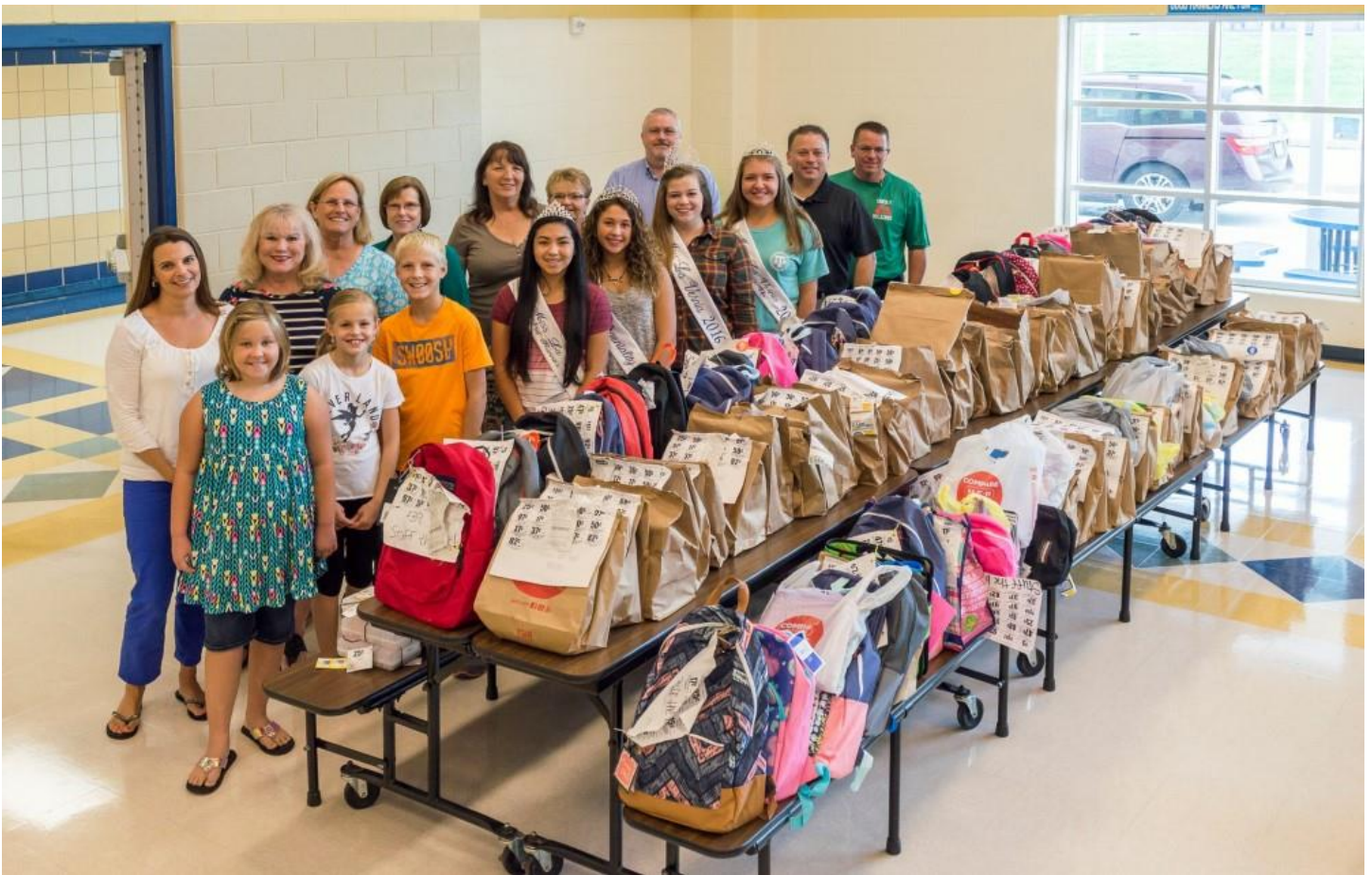
The San Antonio Northwest Lions donated and delivered school supplies to four elementary schools in their service area.