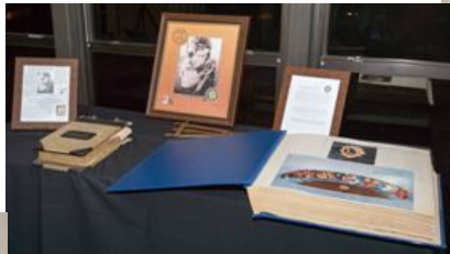
Gunter Hotel Lobby 12/4/1913