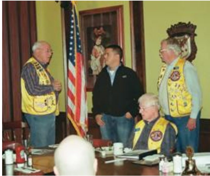
At Logan's Roadhouse for the Human Needs Board: