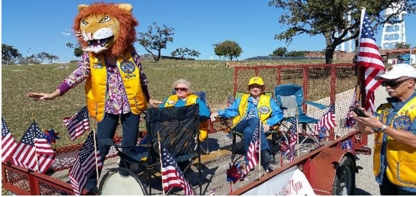
Decorating for the VA parade.

The Kerrville Host Lions Club participated in two parades in November. The first parade was at the VA Center in Kerrville to honor the veterans for Veterans Day. The second parade was the Annual Kerrville Christmas Parade.