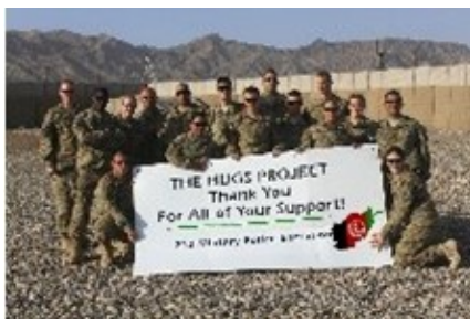
A “thank you” from our service men and women in Afghanistan

During the month of November, 2013, thirteen (13) District Lions clubs collected personal care and non-perishable snack items such as toothbrushes/toothpaste, shaving gel, disposable razors, deodorant, and beef jerky for the troops serving our country in Afghanistan.