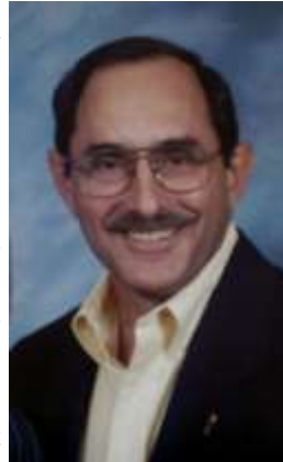
2nd VDG San Pantusa

Got a little secret -- Looks like you'll be getting an invite right after the New Year to the Char-