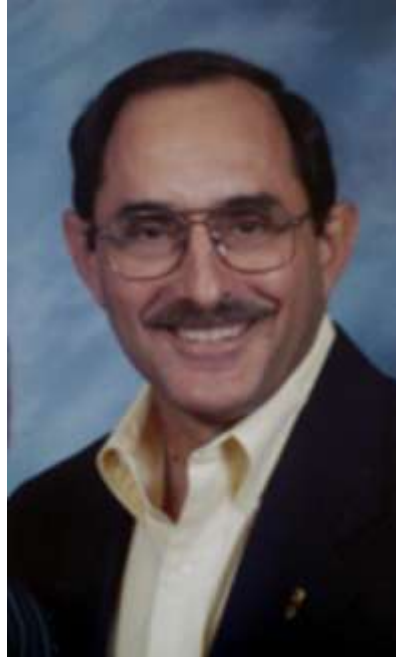
2nd VDG San Pantusa

I want to share a great experience I had the other night when I was able to attend the end of Spring Semester Meetings of the two Campus Clubs. If you want a lift and a surge of energy, visit with the Campus Clubs or ask them to come help you with a project. OLLU Lions and UIW Lions had elections and passed the respective batons to their incoming officers at their meetings on April 25. Since they are on unusual schedules during the Summer and some are graduating they, basically, end their year and crank back up in September. Even though Finals are looming, they showed the excitement that they have for being members of their Proud Clubs and for the spirit of service that is marked by their work through-