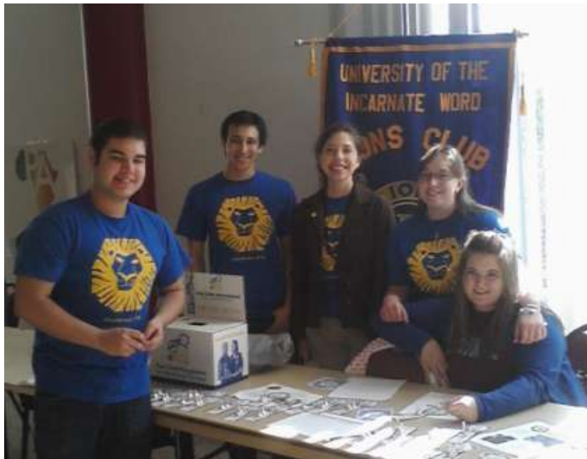
UIW Lions at their Club Rush in their customized shirts