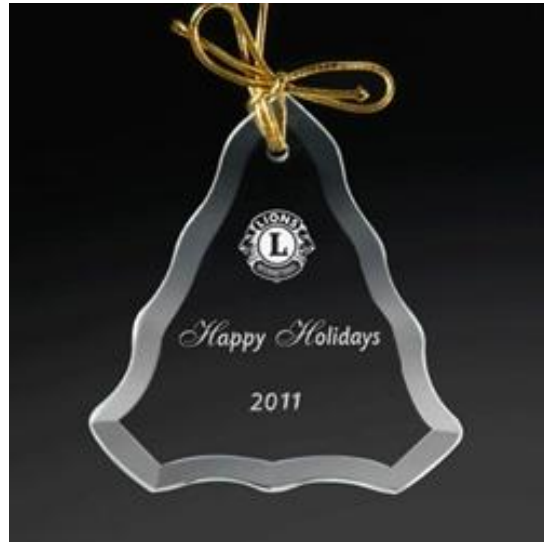
Jade Glass Tree (H45)