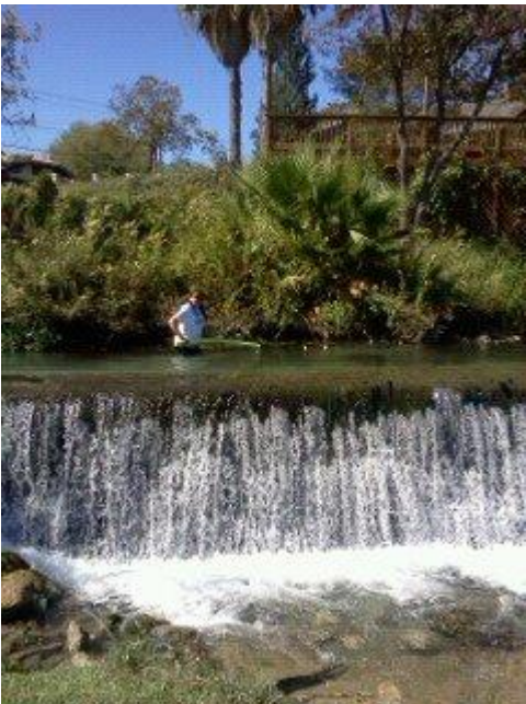
There HAS to be a warmer way to guide the ducks out of the bushes!