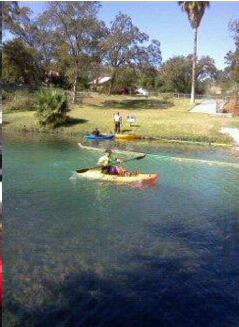
Chasing runaway ducks.