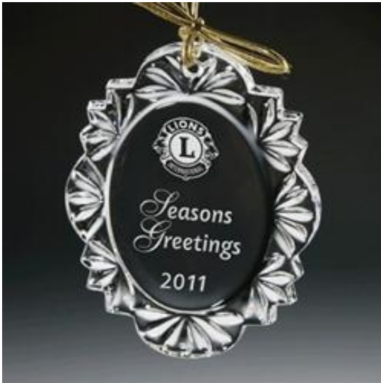
24% Lead Crystal Oval (H41)

Limited Time Offer Don't miss out on these fabulous gifts.