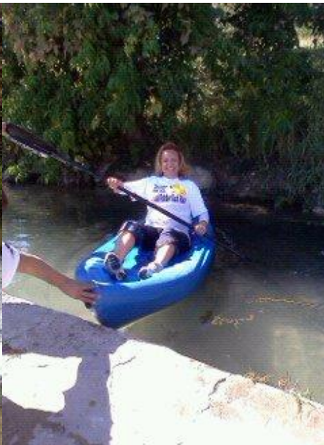
Don't I get a lesson first?