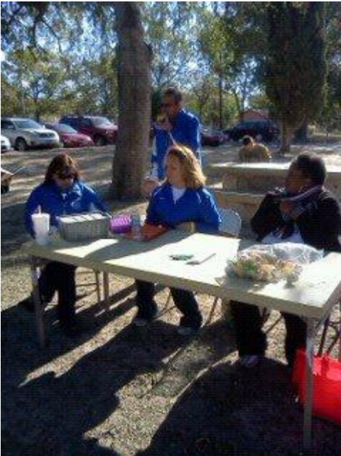
Registration, selling ducks, and trying to stay warm!

Even though the Annual Duck Race was held on the day the first cold front of the season decided to visit Del Rio, the ladies of the San Felipe Del Rio Amistad Lions Club jumped in (for some, literally) and made the best of it. This year's activities included a cake walk, a talent show, fun activities and of course, the Great Duck Race of 2011. Congratulations to the Amistad Lions Club for hosting a successful event, and for the favorable public relations it created for Lionism.