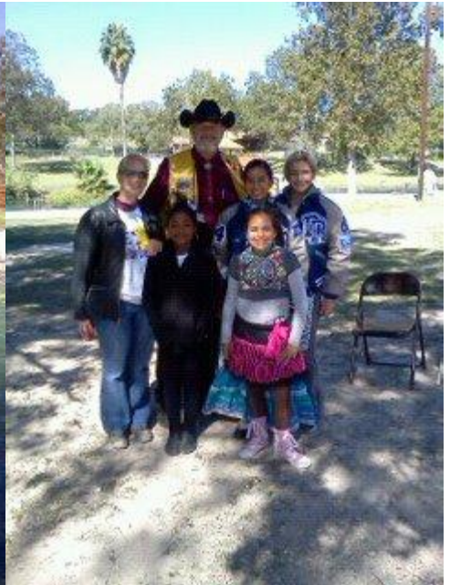
Judges of the talent contest with the winners!