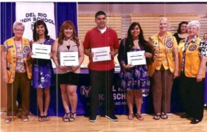
Four of Del Rio Host Lions Club scholarship recipients. The club awards $12,000 in scholarships each year.