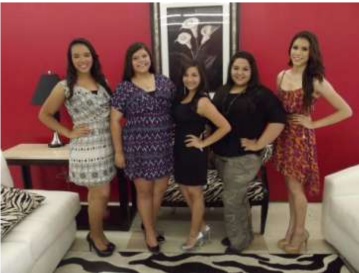
2012 San Felipe Amistad Lions Ambassador of Goodwill Contestants