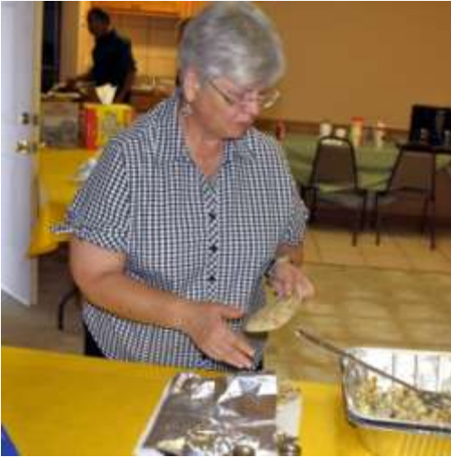
Let's see...is it tortilla in the eggs or eggs in the tortilla?