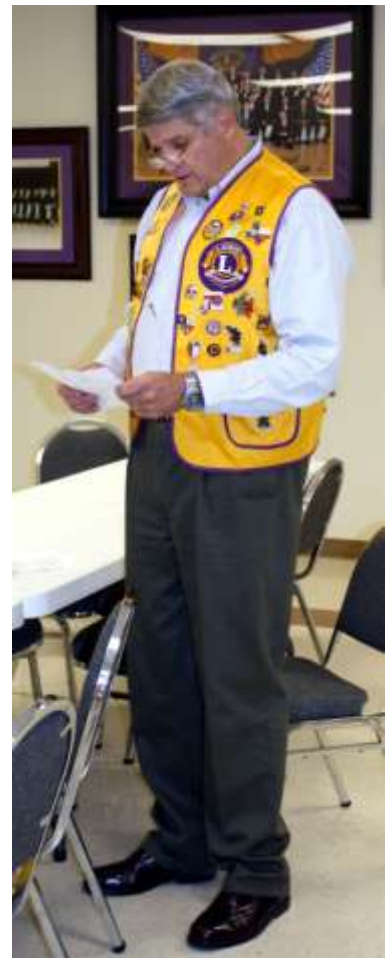
Today in history, nothing happened.