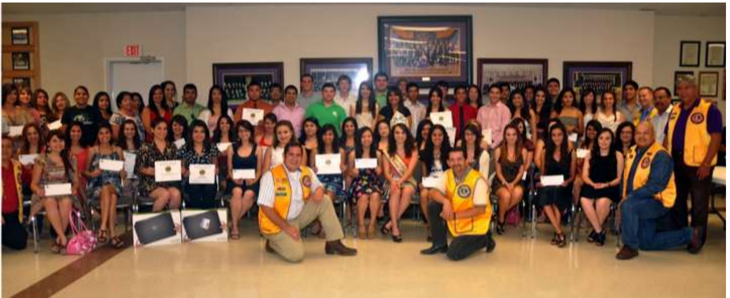
Scholarship recipients from the San Felipe Lions Club. $34,000.00 ($8,500.00 in form of a laptops) for high school students and $7,500.00 for the college. students