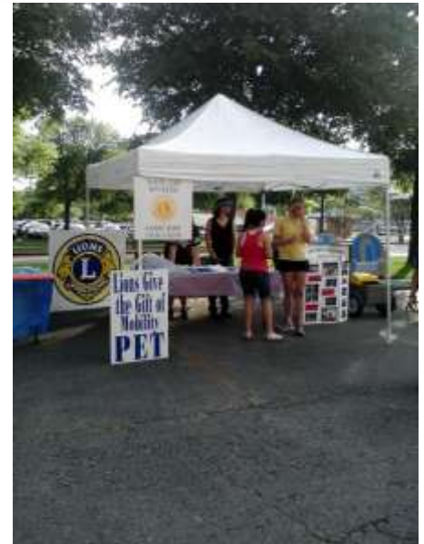
19th Annual Texas Lions Camp Harry Wickersham Golf Tournament