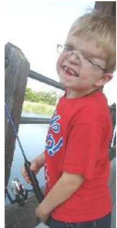
August 2, 2012 Tapatio Springs Golf Course and Resort Boerne, Texas