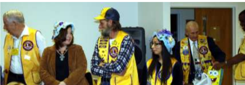
I agree. Everyone should be required to wear a hat.