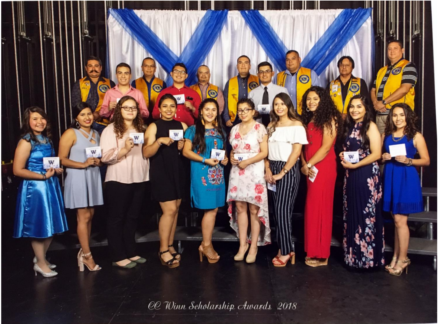
Lion members presenting scholarships to local high schools seniors at C C Winn High School, July 2018.