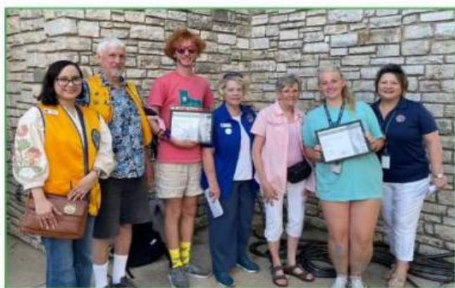
Scholarship presentation (above) at awards ceremony (right) following dinner