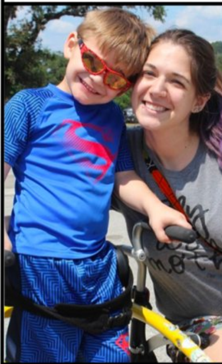
Children Can...With TLC™

TLC is tax exempt under 501(c)(3) of the I.R.S.—Donations are tax deductible—see your tax professional for details.