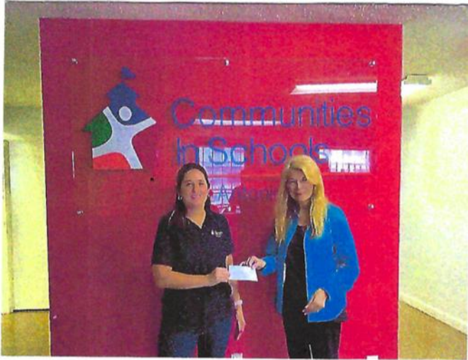
Alamo Heights Lions at work.