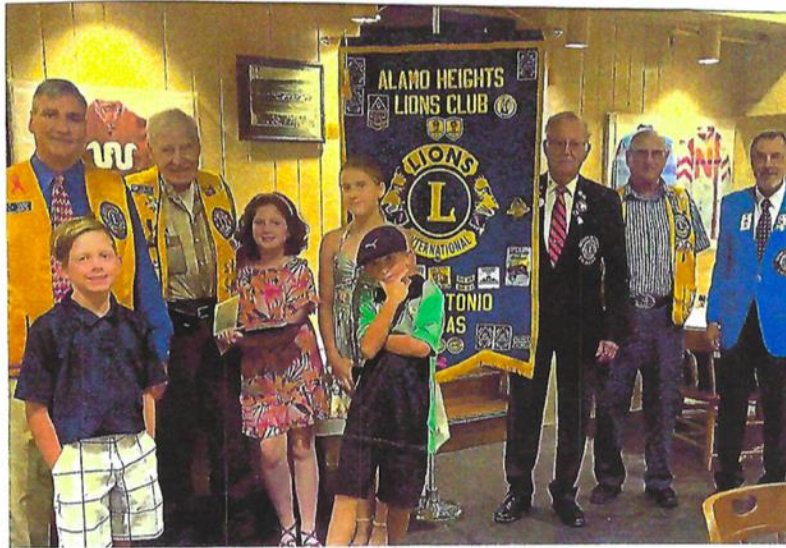
Installing our new Alamo Heights Officers for Lions Year 2022-2023.