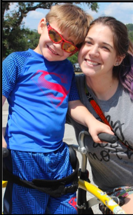
Children Can...With TLC™

TLC is tax exempt under 501(c)(3) of the I.R.S.—Donations are tax deductible—see your tax professional for details.