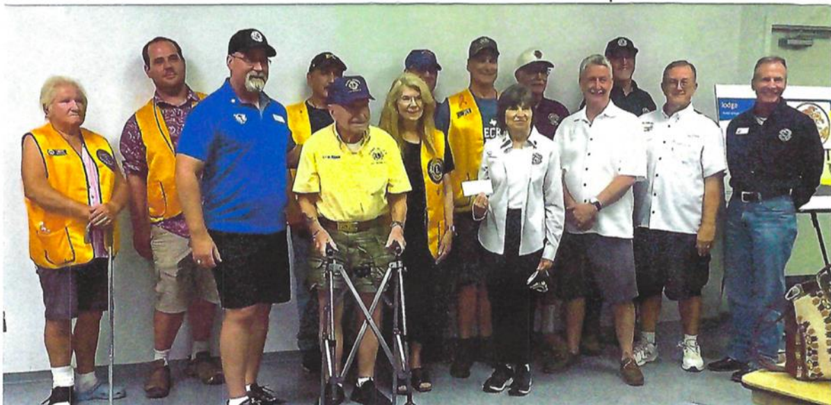
Donating to the Texas Lions Camp.