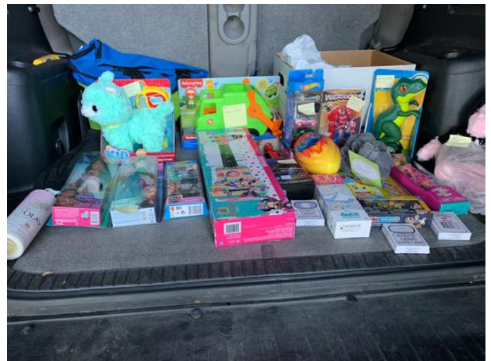
The first delivery of toys submitted to Toys for Tots from a UIW American Sign Language class. Toys for Tots box will be accessible for donations during UIW's Light the Way on November 20.